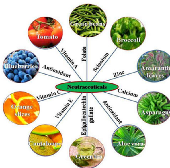
Figure 1 Natural products and their use as nutraceuticals