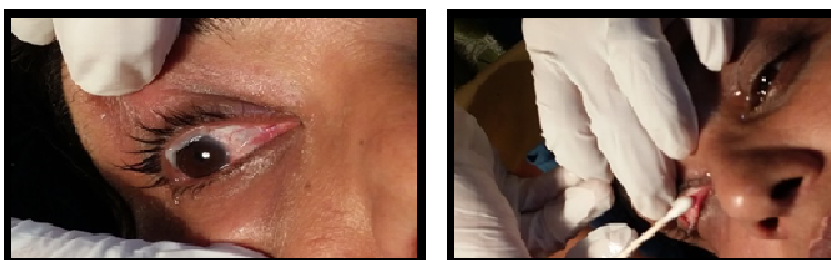
Figure 2 Dead tissue on the eyes lids and removal of the dead tissue using a cotton swab.