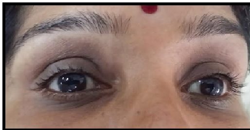
Figure 3 After 24 hours of exposure