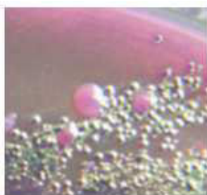
2(a) E.coli, klebsiella